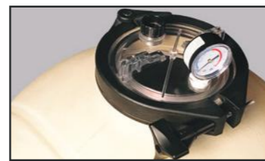
Easy-to-read pressure gauge for inspection