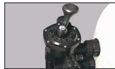
Equipped with a 6-way multiport valve